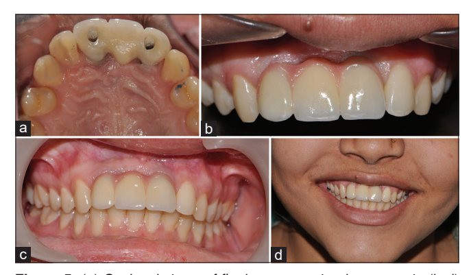
Figure 5: (a) Occlusal views of final screw-retained crown unit. (b-d) Facial views of final screw-retained crown unit

encountered with posterior implants, as they are positioned more axially in relation to the alveolus and tooth. However, it is problematic with anterior teeth as the implants need to be inclined lingually to allow screw emergence through the cingulum area of the restoration.<sup>[2]</sup>