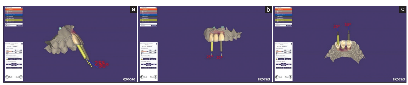
Figure 3: (a-c) Angulation rectification using computer-aided design and computer-aided manufacturing